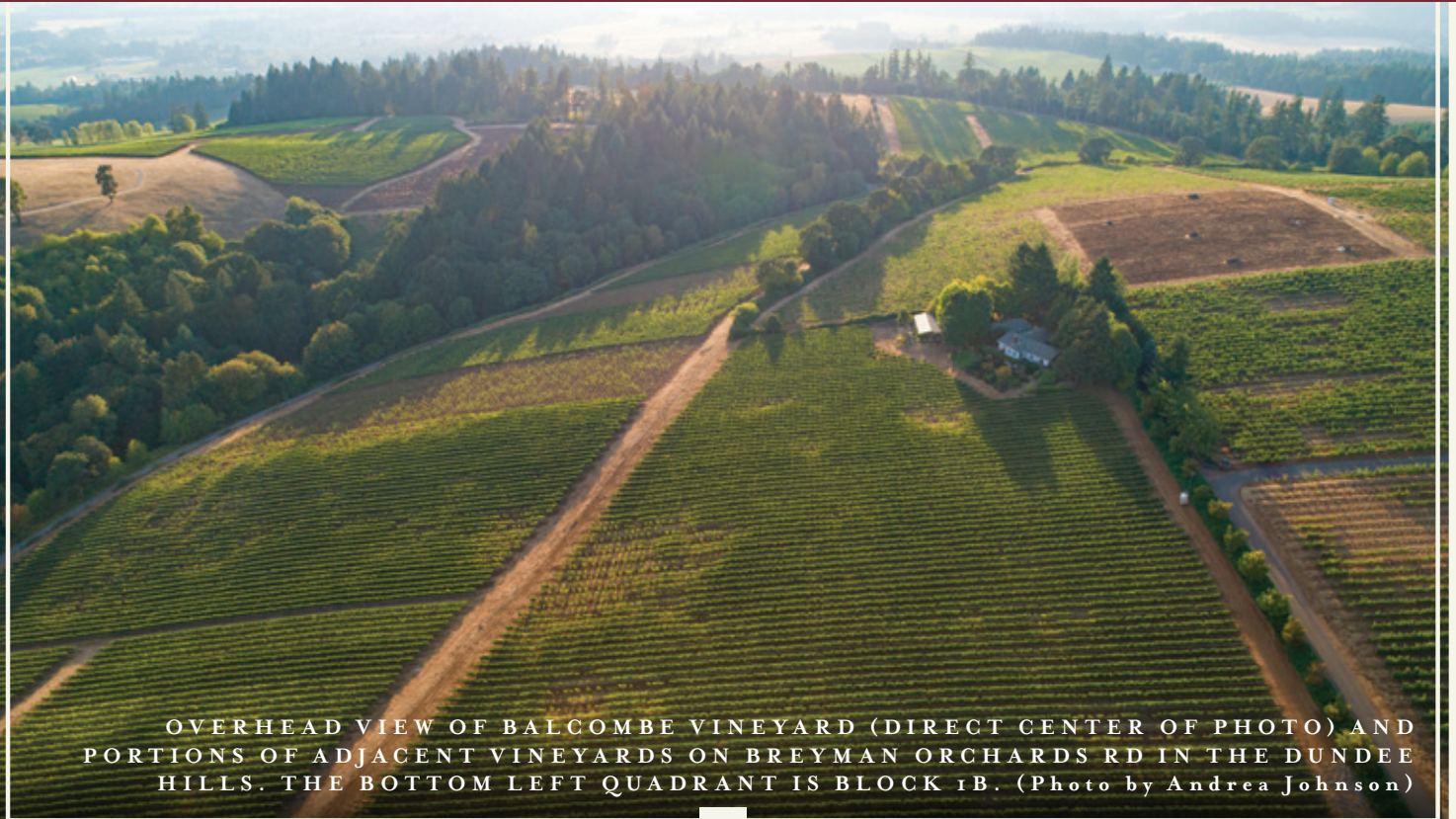
OVERHEAD VIEW OF BALCOMBE VINEYARD (DIRECT CENTER OF PHOTO) AND PORTIONS OF ADJACENT VINEYARDS ON BREYMAN ORCHARDS RD IN THE DUNDEE HILLS. THE BOTTOM LEFT QUADRANT IS BLOCK 1B.