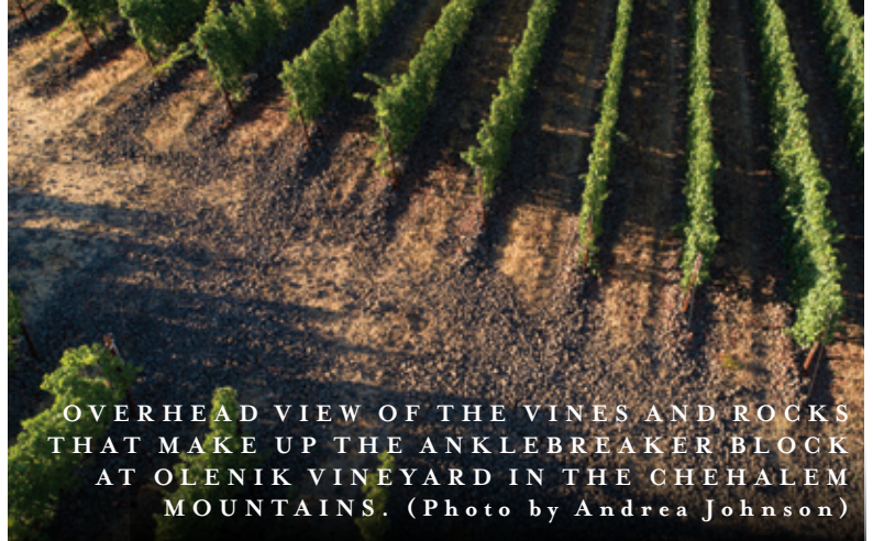
OVERHEAD VIEW OF THE VINES AND ROCKS THAT MAKE UP THE ANKLEBREAKER BLOCK AT OLENIK VINEYARD IN THE CHEHALEM MOUNTAINS.