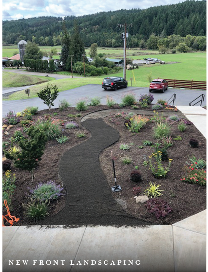
NEW FRONT LANDSCAPING

The Ribbon Ridge AVA, while known for producing some of the most vaunted and sought-after Pinot Noirs in Oregon, is still somewhat undiscovered territory. There are only a few wineries and most are strictly production facilities. In our new space, we offer one of the rare opportunities in this AVA to connect the aromatics, textures and flavors of the wine to what people are seeing. While we live the link between our wine and site, most people (even many who have come here for years) simply have not seen the scope of our place.