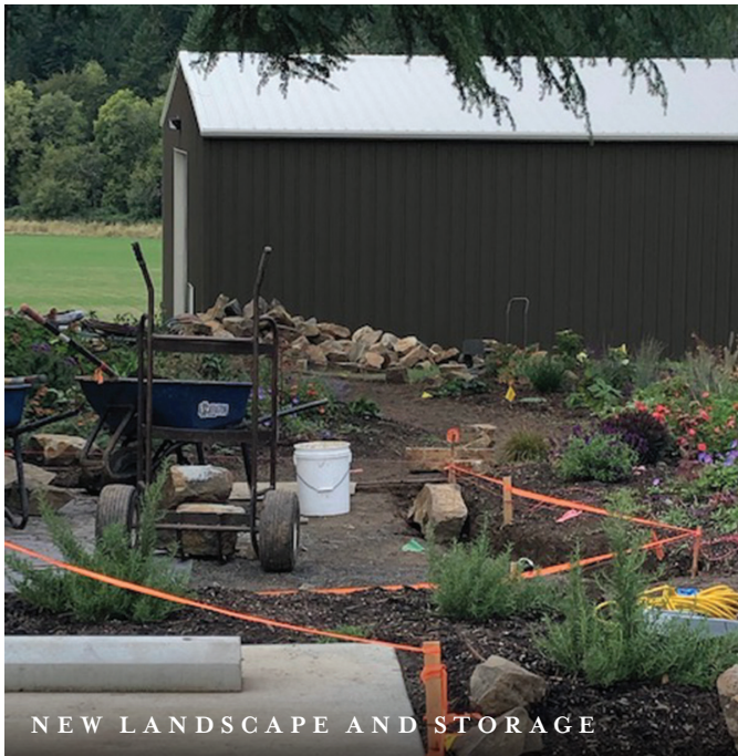
NEW LANDSCAPE AND STORAGE

If you have visited in the past year, we have been doing a lot at the property to take what was acceptable, functional and classically “Oregon good enough” and turn it into something that is distinct and a positive step forward allowing us the ability for more accommodations. We have been taking the same strides in our vineyard. There are many dramatic examples of these changes that we are extremely excited about coming to fruition in the future years.