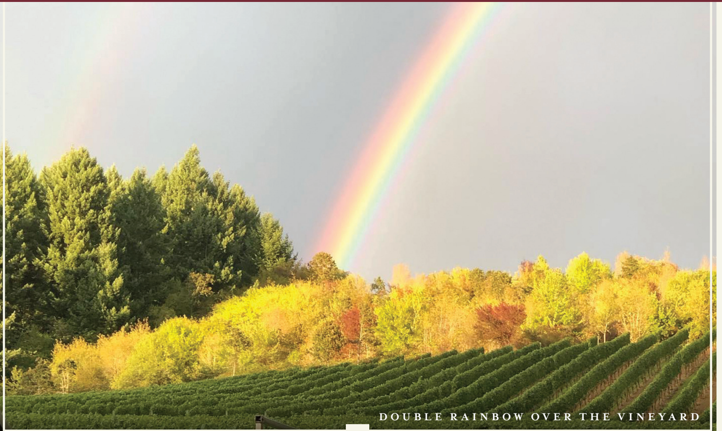
DOUBLE RAINBOW OVER THE VINEYARD